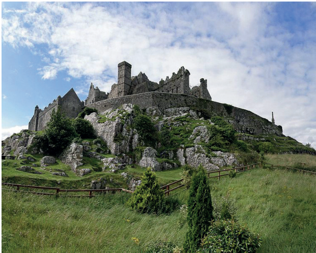
The Rock of Cashel, Ireland

If you ask people about Irish dancing, they will probably mention (probably, mention) Riverdance – The Show . (1) _____ (know) for its rapid leg and foot movements, body and arms being kept largely stationary, Riverdance as (2) _____ (???) as other shows that followed have