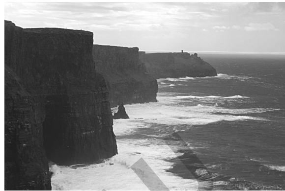
Cliffs of Moher, Ireland

Die vorliegende Unterrichtseinheit ist wie eine Abschlussprüfung aufgebaut. Sie umfasst die Kompetenzen reading , use of English , guided writing und speaking . Die Lernenden erhalten nützlichen Tipps, erarbeiten Bindewörter sowie Redemittel und durchlaufen prüfungsähnliche Situationen. Eingebettet in das Thema „Irland“ verfassen sie zwei Texte im guided writing und diskutieren, was sie bei einer Reise durch das Land berücksichtigen müssen. Am Ende der Unterrichtseinheit erhalten sie eine Rückmeldung zu ihrer Leistung.