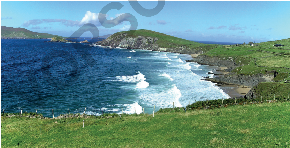
Ring of Kerry, Ireland