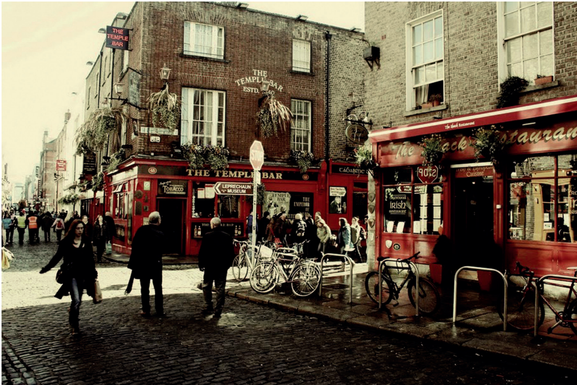
Temple Bar in Dublin, Ireland